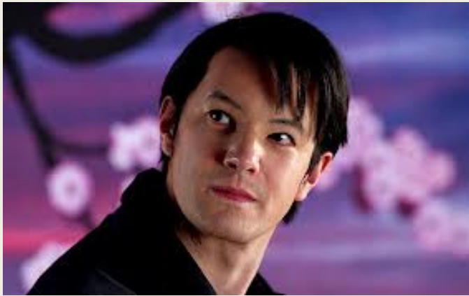
Jim Sturgess as Hae-Joo Chang “Cloud Atlas” (2012)

It STILL continues in the 21 st century!!!